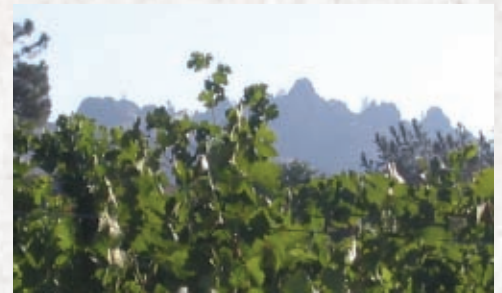
View of the Pinnacles.

Since Brosseau Wines is vertically integrated, they will always be guaranteed a consistent and high quality supply of fruit. As they grow their production, Brosseau Vineyard will be ready to match the needs, whether it is additional fruit from one variety or for clonal diversity. In today's current market of wineries sourcing from multiple vineyard sites, Brosseau Wines is hoping to rekindle the excitement for Estate-based wine programs.