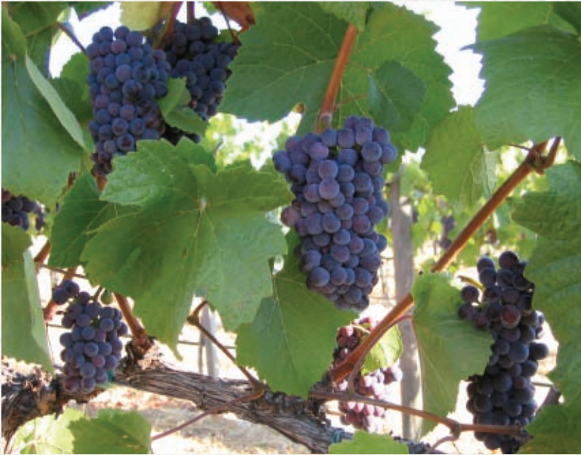
Some Pinot Noir clusters turning color.