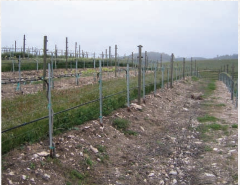
Rare blend of Limestone and Decomposed Granite soils.