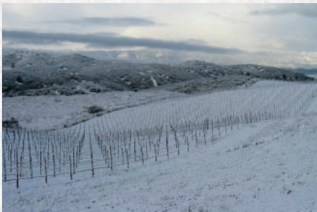
High altitude farming.

Brosseau Vineyard currently grows Chardonnay, an array of white varieties, Pinot Noir, Syrah, and an array of eclectic red varieties for Brosseau Wines. Yields range from 1 to 3 tons per acre. Each block of vines has differing levels of nutritional needs, as well as vine age, hence yields are not consistent from block to block. Following 25 years of sustainable farming, Brosseau Vineyards is shifted towards organic practices as a means to farm the land with an even greater care than before. Full certification commences in 2010. Brosseau Vineyards provides fruit to a number of high end wineries and has benefited from these relationships as well.